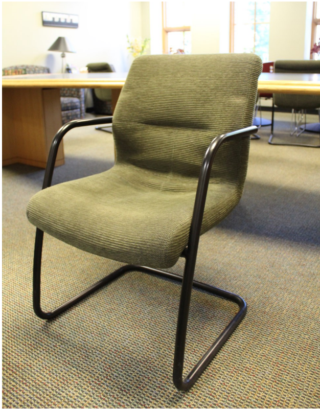
Sled Base Padded Chairs (Green)

8 available | Price: $15 each or 2 for $20