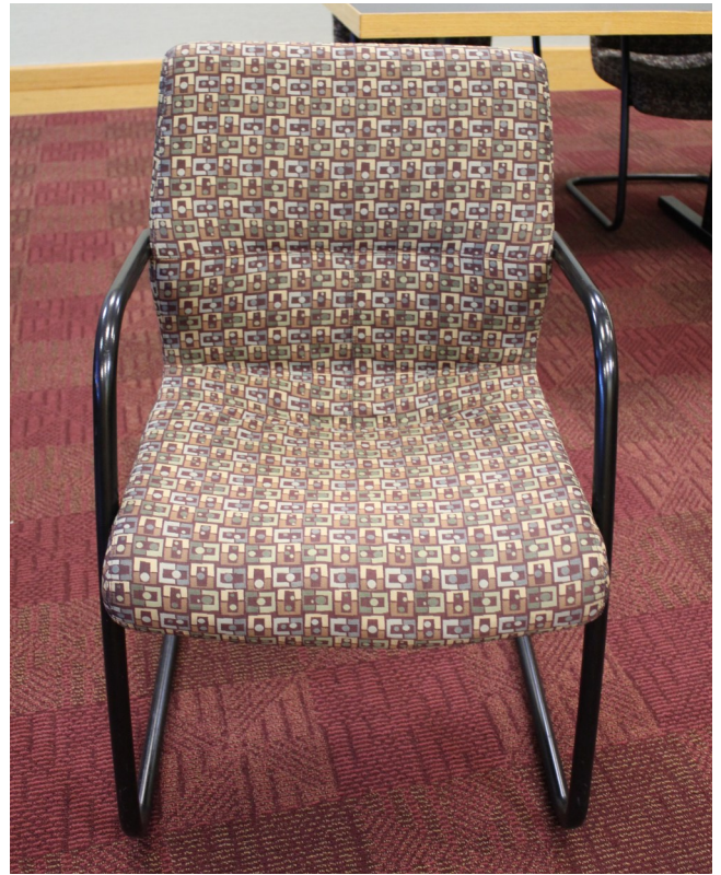
Sled Based Padded Chairs (Patterned)

8 available | Price: $15 each or 2 for $20